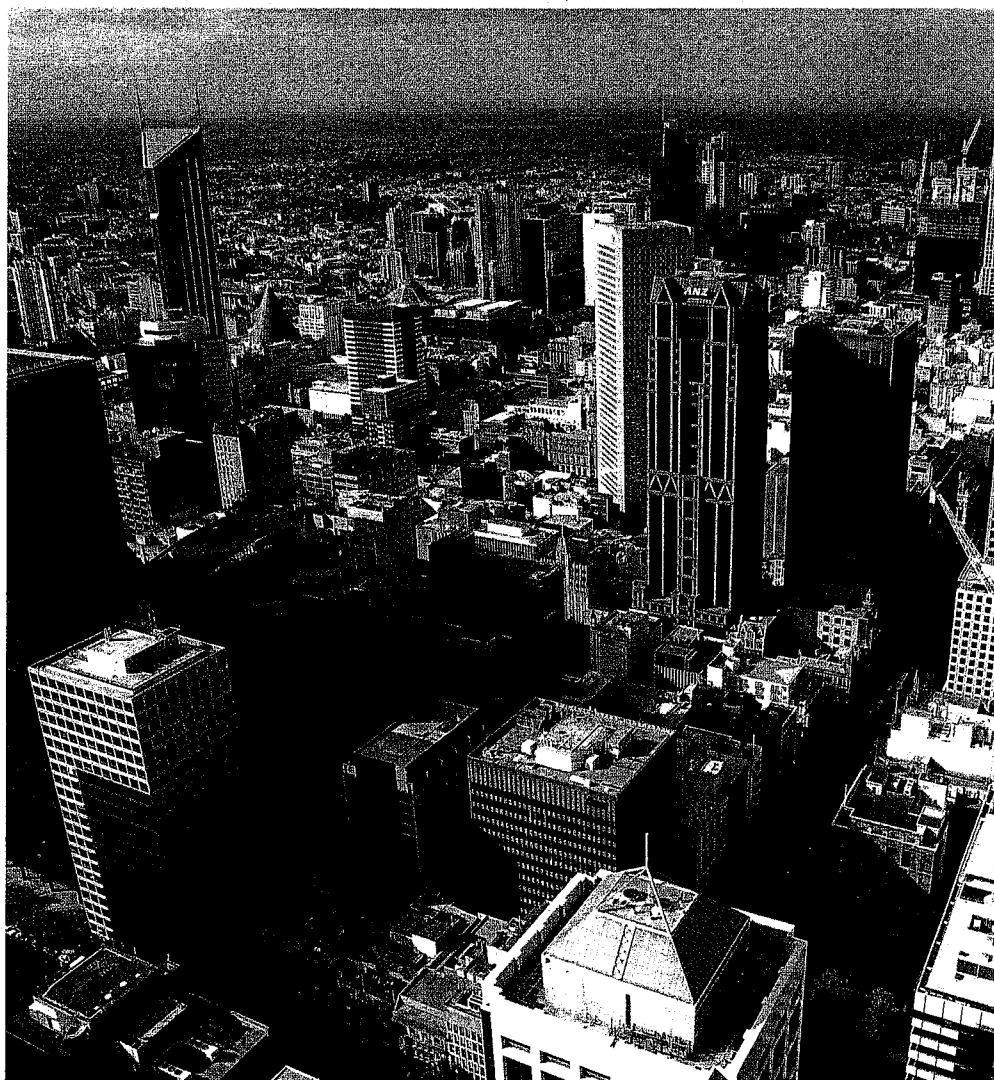
City of Melbourne

An independent person who is called upon to conduct an arbitration. Is usually a person with experience and/or